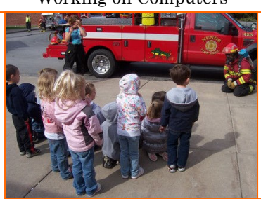
Fire Safety & prevention Day